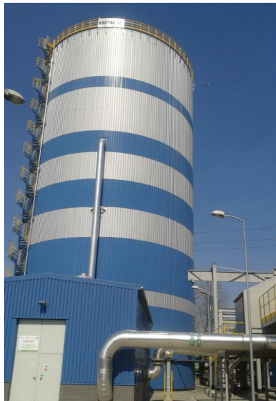
Fig. 7. TES in Bialystok CHP plant.