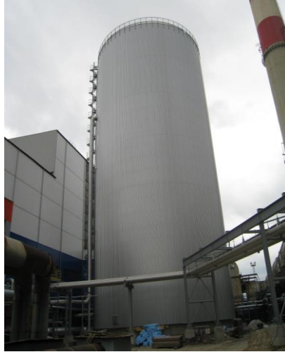
Fig. 6. TES in Cracow CHP plant.