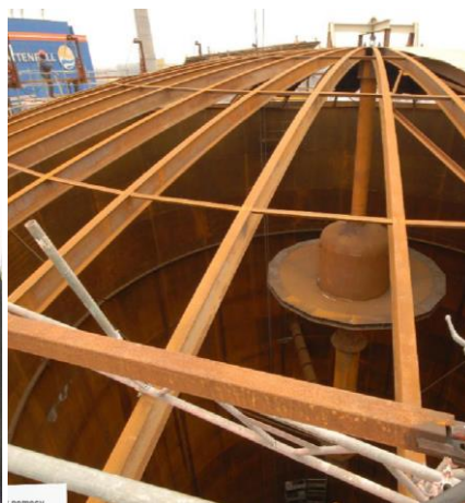
Fig. 3. Upper orifice in the tank of TES.

Due to application of the TES in Siekierki CHP plant, only in 2009 year i.e. in the first year of the TES operation, overall efficiency of energy generation (heat and electricity) by the plant has increased from 86.6% to 87.3% [6]. Also, temporary run of peak water boilers was reduced by nearly 70%, production in cogeneration mode in the CHP plant was increased significantly and reduction of pollutant emissions i.e. dust, SO 2 , NO x to the atmosphere was observed [6].